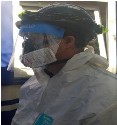
combined visor and mask